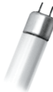
Photo Resist Exposure Tube 416B

The 416B is a direct replacement bulb for the 416X Exposure Kit .